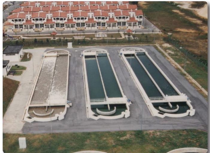
This LOOP Treatment Plant consists of three oxidation ditches and is capable of treating peak flows of 5.5 MGD (20,817 m 3 /d). Its sister plant consists of 5 ditches which treat peak flows of 19.5 MGD (73,807 m 3 /d). The heart of these oxidation ditch treatment systems is the Smith & Loveless LOOP Brush Aerator.