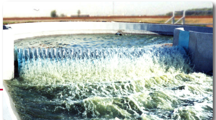
The LOOP is an acronym derived from Low Operation cost Oxidation ditch Plant.